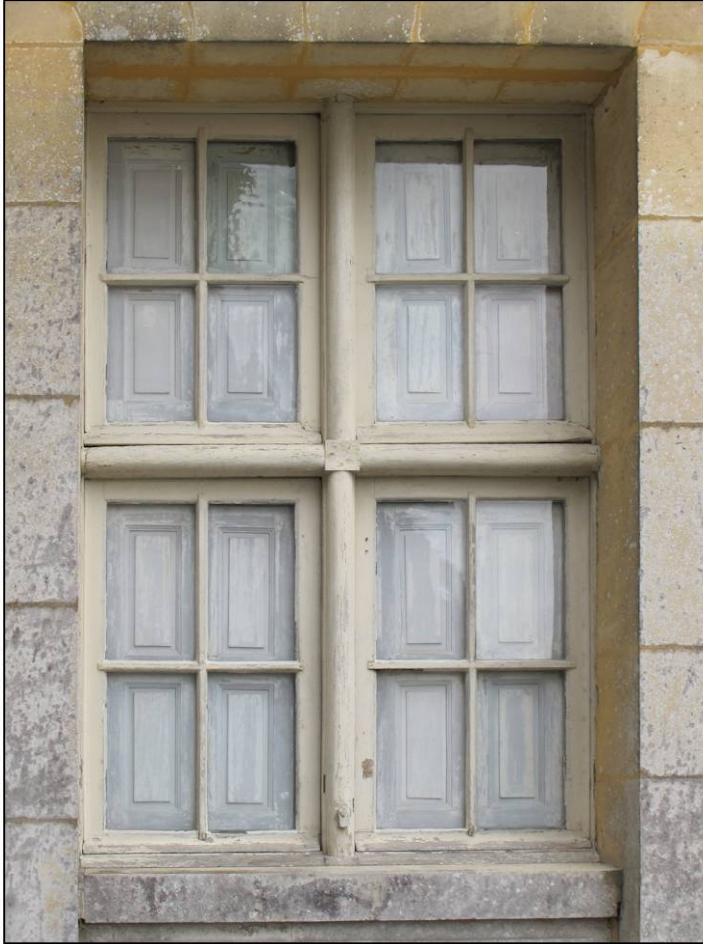
Fig. 12.1. Elévation extérieure