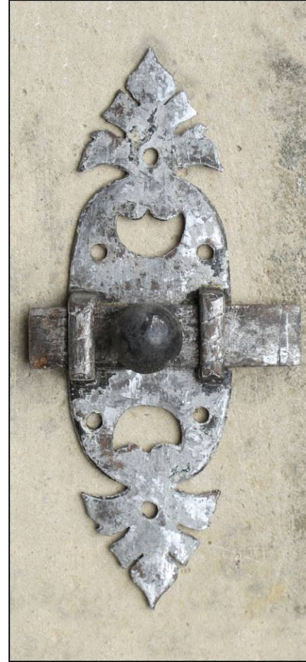
Fig. 12.3. Targette