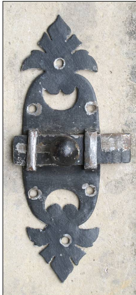
Fig. 12.5. Targette