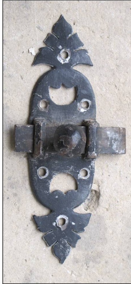
Fig. 12.2. Targette