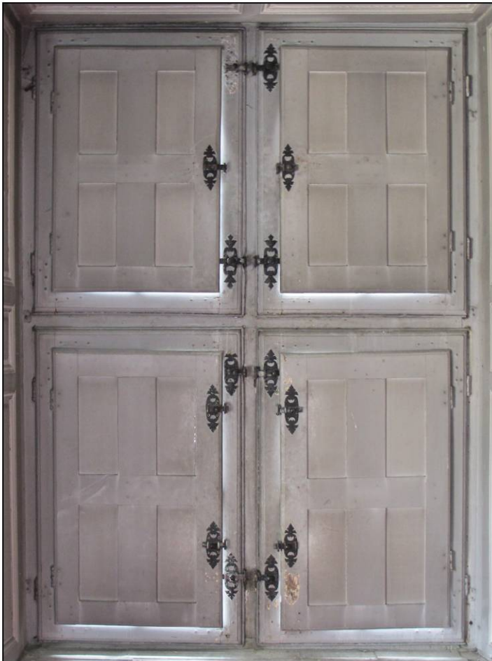
Fig. 12.4. Elévation intérieure