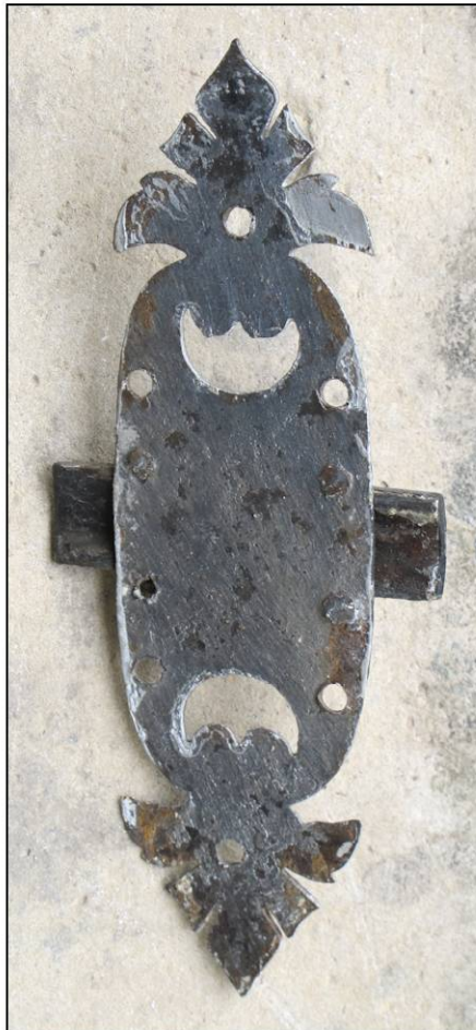
Fig. 12.6. Targette